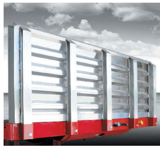
■ Factory-Installed D.O.T Rated Aluminum Bulkheads add strength and security for your driver and the load.