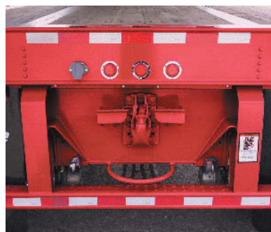
■ Pintle Hook