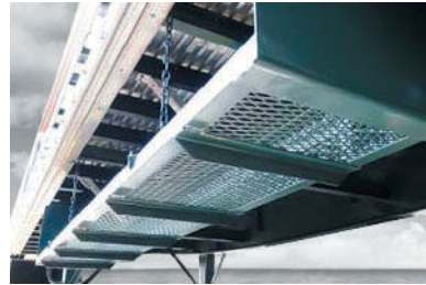
■ Dunnage Rack