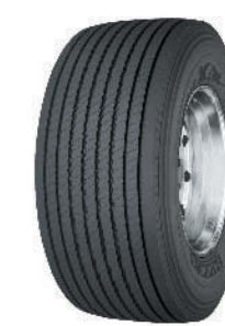
■ Tire Options Optional tire brands are available in dual- and wide-base styles. EPA SmartWay®-verified and CARB compliant brand options also available.