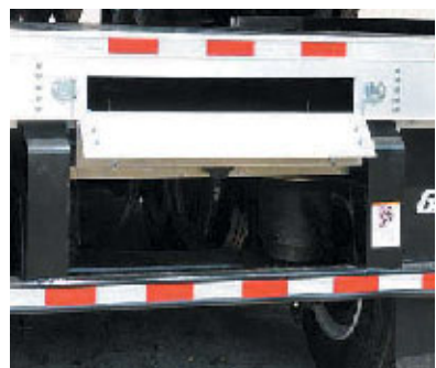
■ Rear Dunnage Rack