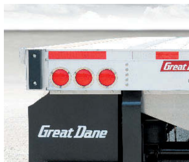
■ 6-Lamp Buckplate