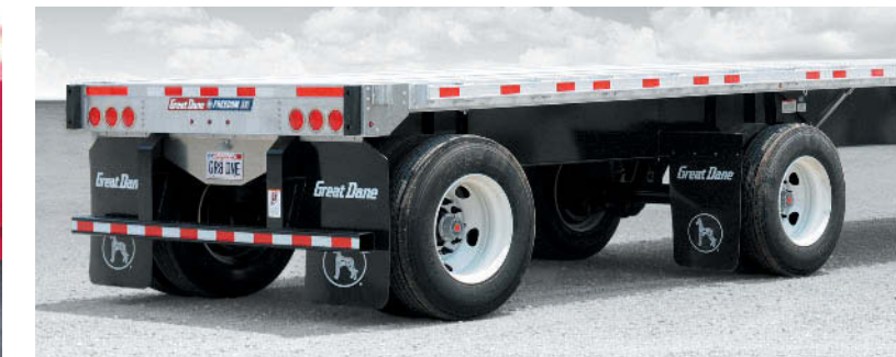
■ Widespread Tandem Package allows for an increase of the allowable legal weight per trailer axle, providing flexibility of load placement and the potential for higher cargo loads.