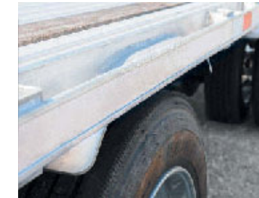
■ Continuous Rail Wheel Pan