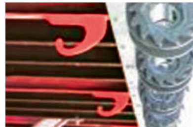
■ C Hooks are located on the underside of the trailer.