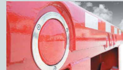
■ Custom Paint