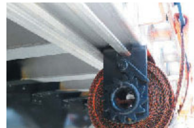
■ Aluminum Double L Winch Track