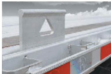
■ Sliding Chain Hooks & Tracks allow for the use of chains and binders anywhere along the length of the side rail.