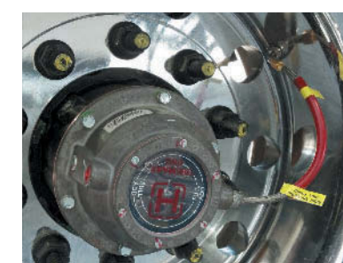
■ Automatic Tire Inflation Systems help extend tire life and increase fuel efficiency by using compressed air from the tractor to maintain tire pressure settings during operation. Multiple tire inflation systems are available as options.