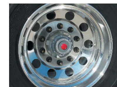
■ Wheel Options A variety of wheel selections to help achieve added payload and fuel savings are available. • Aluminum Wheels • Wide-Base Steel Wheels • Wide-Base Aluminum Wheels