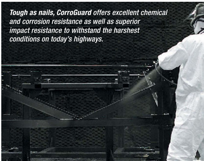
Tough as nails, CorroGuard offers excellent chemical and corrosion resistance as well as superior impact resistance to withstand the harshest conditions on today's highways.