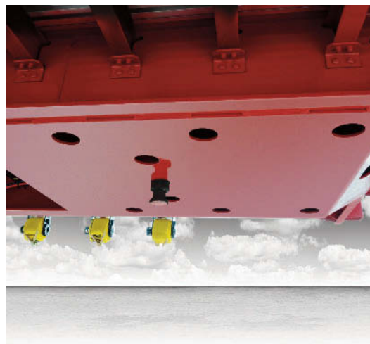
■ .38" Thick Upper Coupler fifth-wheel plate provides greater strength and corrosion protection.