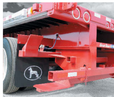
■ Piggyback Forklift Options