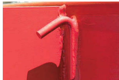
■ Rope Ties can be located on the side rail as well as on the front and rear crossmembers.