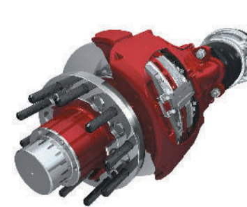
■ Air Disc Brakes offer reduced stopping distances when compared to drum brakes and help reduce stop brake fade. A variety of options are available.