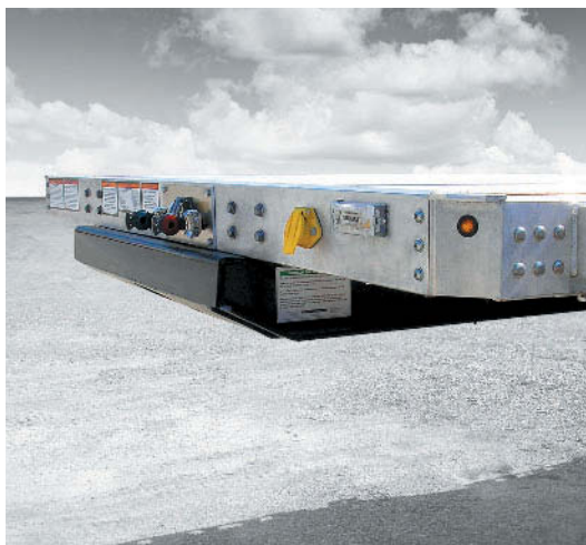
■ Aluminum Front Crossmember is secured with a fatigue-resistant bolted attachment.

The Freedom LT can be outfitted with these popular options: