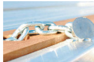
■ Pull Up Chain Ties