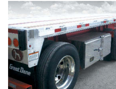
■ Full-length Rub Rail