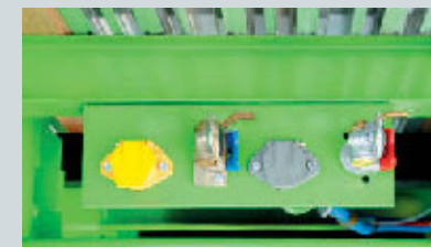
■ Air & Electrical Locations