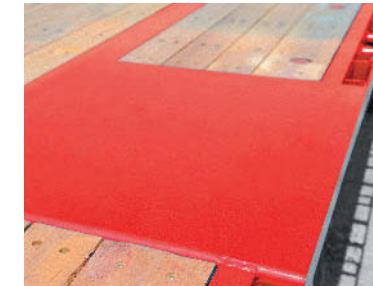
■ Floor Pans For deep drop configurations floor pans are located above the tires allow for maximum tire clearance.