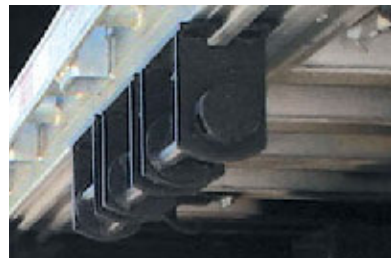
■ 3-Bar Winches make load securement fast and easy.