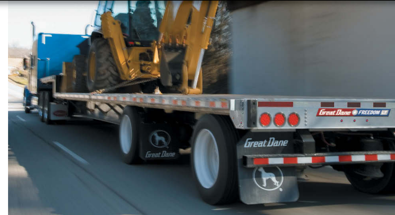
■ Drop Deck Option offers lower deck heights for tall or heavy-duty hauling. Standard upper coupler height is 48" with an 18" king pin location. Drop depth from the upper deck is 20" with a rear deck height of 40". Reinforcing doubler plates in critical stress areas like crossmember punches and upper to lower transition area increase durability. Widespread configurations are further supported by reinforcing gussets in the suspension area.