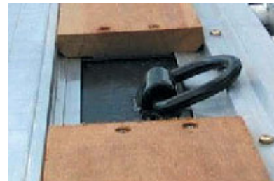
■ D Rings are recessed below the floor level.