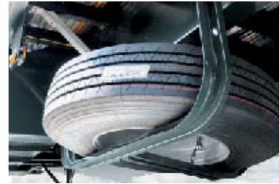
■ Tire Carriers